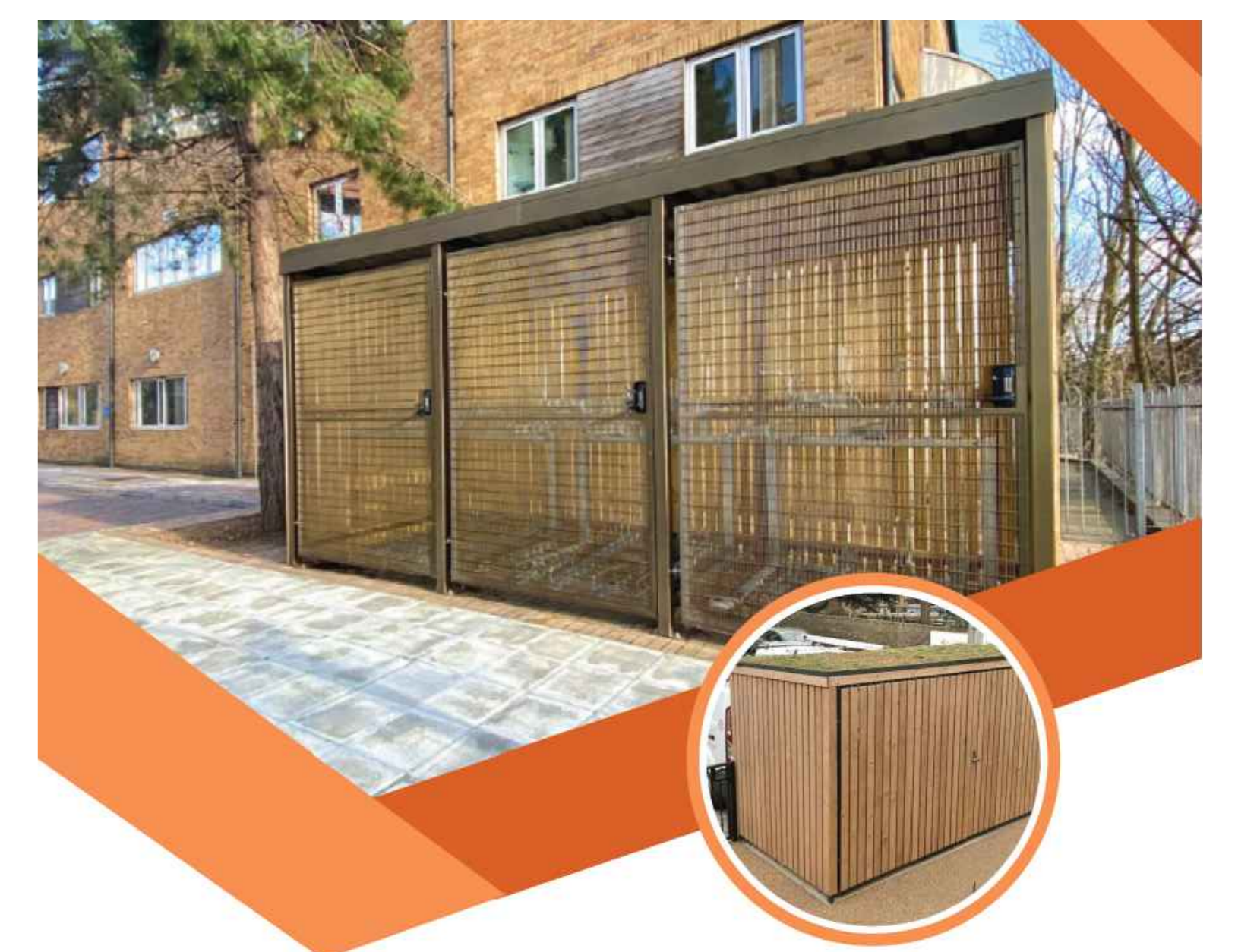
20 BIKES PER SHELTER