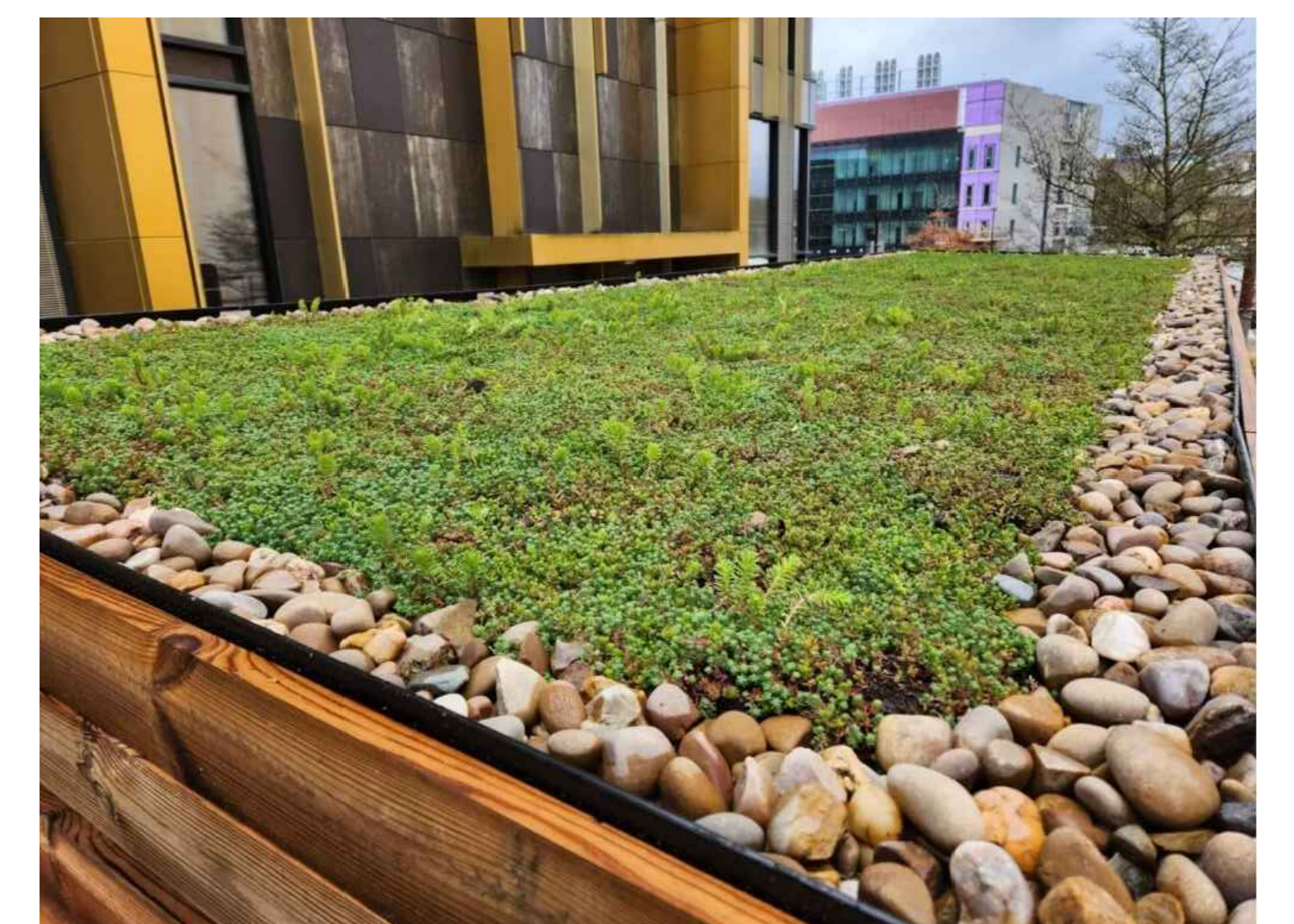
GREEN ROOF COVERING